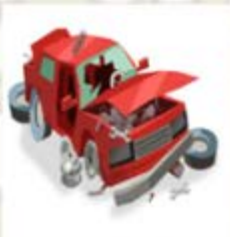
Abandoned & Junked Vehicles