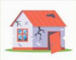
Exterior Property Maintenance Standards