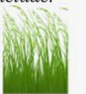
Weeds & Noxious Growth