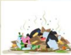
Trash & Debris on Private Property