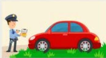
Illegal Parking on Private Property