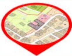
Zoning Ordinance Violations